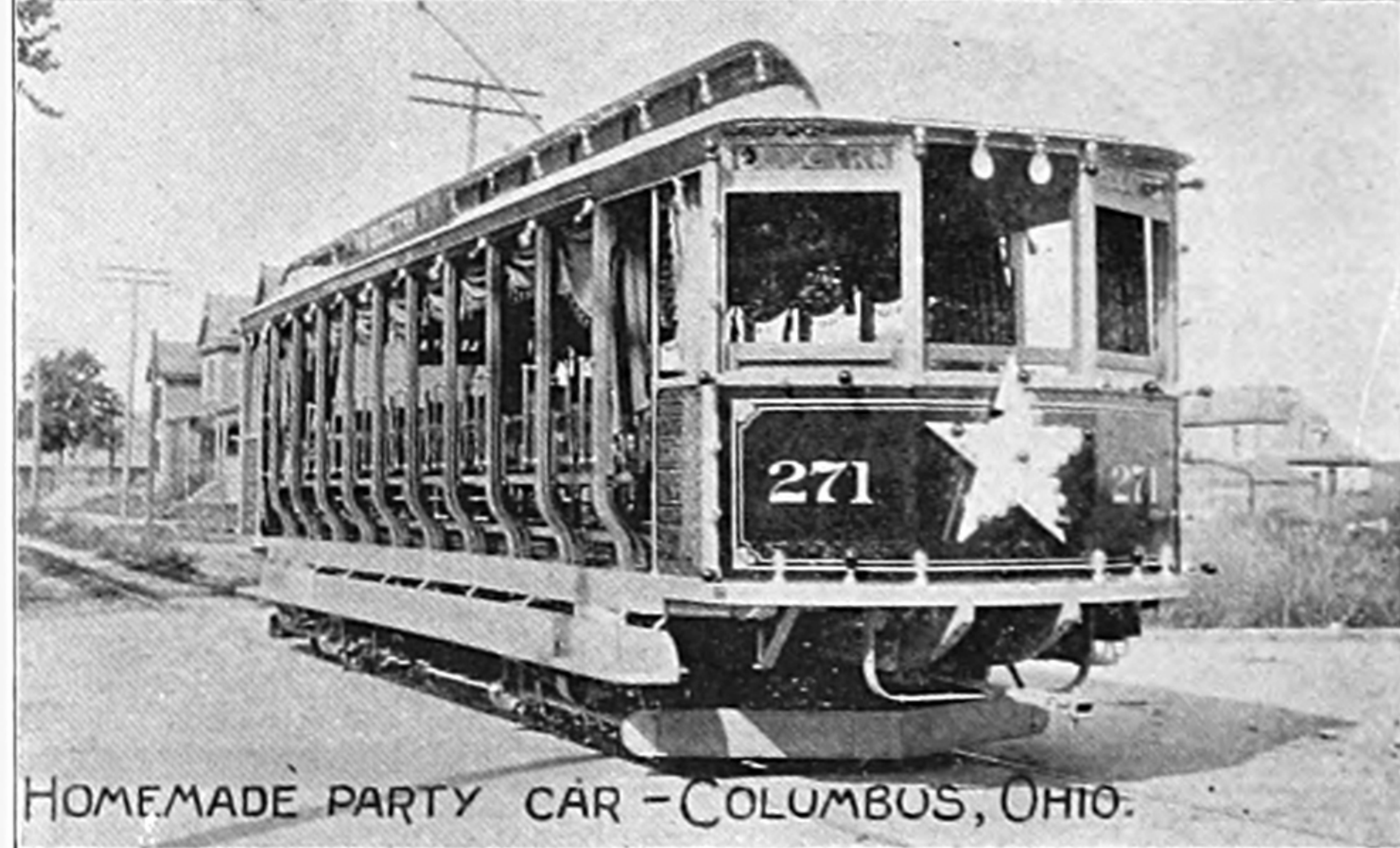
HOMEMADE PARTY CAR - COLUMBUS, OHIO.

On her maiden trip with a party of the company's officials the "Electra" created a decided sensation over the 30 mile route, and has been in great request every night since, except Sundays. Usually the car is engaged from 3 to 5 days in advance. It is let to parties of 20 or 25 at the rate of $10 for 2 hours or less and $2.50 per hour after, until midnight. Superintendent W. F. Kelly will reap quite a harvest before outdoor festivities are cut short by the chilly blasts of Lake Erie.